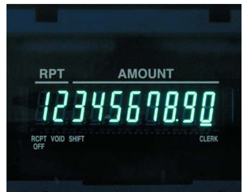
Large 10-Digit Display