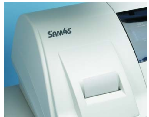
Quick and Easy Drop-In Paper Loading